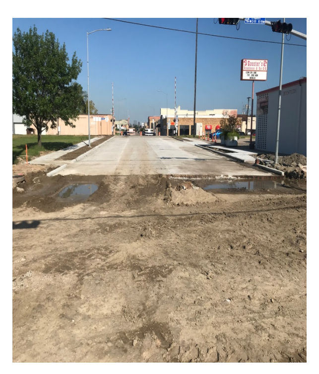
View of W. Texas Avenue between Main St and Commerce St