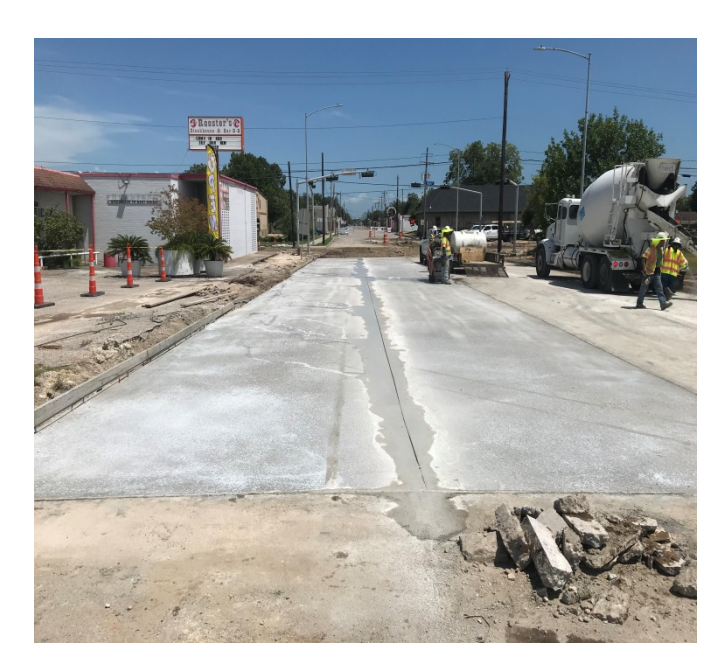
Concrete pour at W. Texas Avenue