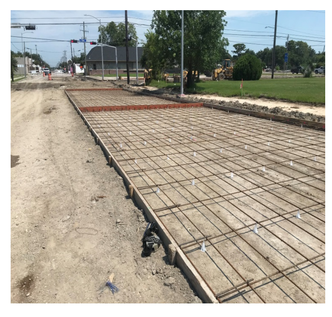
Road Forming work at W. Texas Avenue