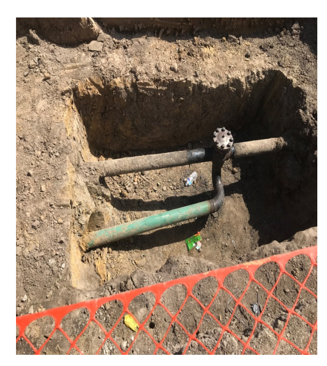
CenterPoint Gas relocated line