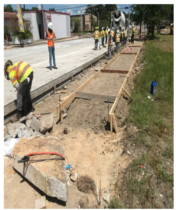
Sidewalk forming work at W. Texas Avenue