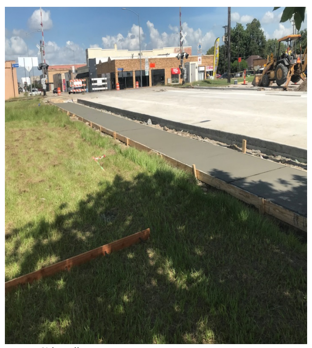
Sidewalk concrete pour at W. Texas Avenue